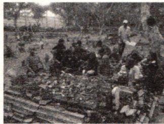
Figure 1. Players, studio owner, and research team laying flowers on the grave of Mbah Purwa

After completing the khataman ritual, and after the midday Zuhr prayers, there was a pilgrimage to lay flowers on the grave of mbah Purwo. Those taking part in the visit to the grave included the head of the Tri Purwo Budaya Art Studio (Wayang Topeng Jatiduwur), together with family, a number of wayang topeng performers, and the research team. Below is a photograph of the visit to the grave.